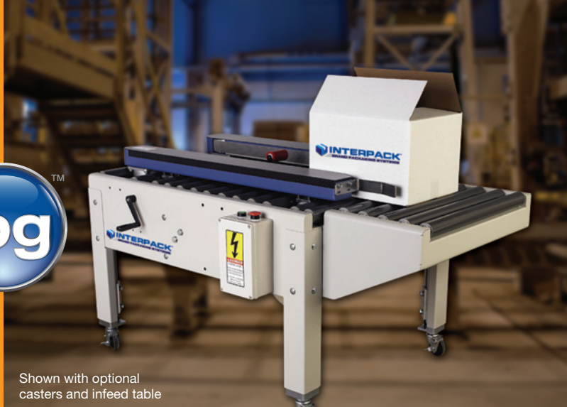
Shown with optional casters and infeed table