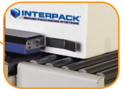
Stainless steel self-centering infeed guides for simple case size setup