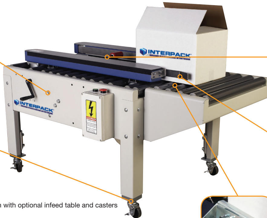
Shown with optional infeed table and casters