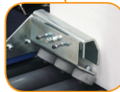
Optional springloaded infeed guide fully closes the bottom major flaps