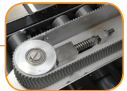
Self-tensioning & self-tracking drive belts simplify belt replacement