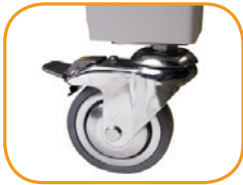
Optional heavy duty swivel & locking casters